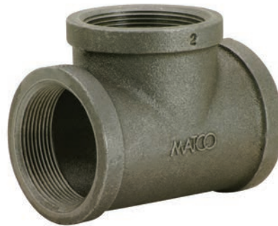
Sample Part # is: Chinese Malleable Black, 150LB, Tee, 2"